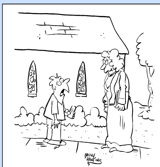
"I'll come to VBS, but can you take the word 'school' out of it?"

Our Mission : Led by the Holy Spirit, we joyfully reach out to the community and the world in faithful love and service as we mature in Discipleship and share the Good News of Jesus Christ.